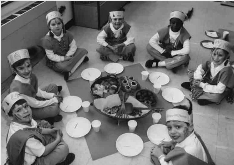
First graders prepare to feast on authentic Native Indian cuisine.